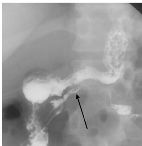
Fig. 2 Gastric leak localized at the distal third

Carucci et al. [13] found 48 leaks in 904 patients after RYGB. In 12 patients, the initial UGI studies did not show leak, but leak was diagnosed with follow-up UGI studies performed 4 to 28 days after the initial surgery. In our patients, UGI was initially negative for leak in 5 patients with intermediate or late leak because the series were performed at POD 3, whereas leak appeared \geq 5 days after